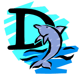
Dickinson East Elementary Dolphins